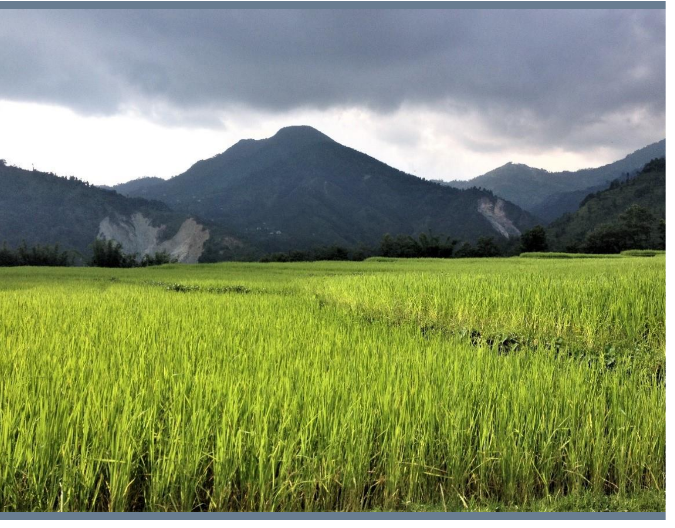
HAFL Hugo P. Cecchini Institute International Cooperation and Development

School of Agricultural, Forest and Food Sciences HAFL